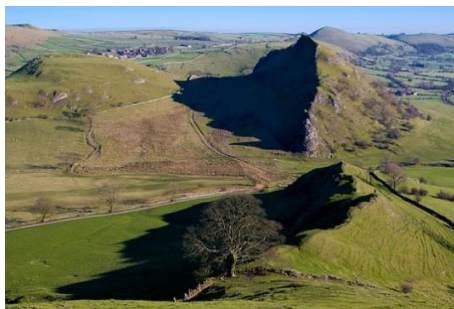
Chrome Hill, Derbyshire (SK 070 673). Apron reef facies in the Bee Low Limestone Formation (Asbian, mid Viséan, mid Mississippian, Carboniferous).

Cost: £25 including transport, packed lunch, field guide and a set of palynomorph slides from the Alportian and Yeadonian sections visited.