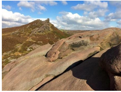
Ramshaw Rocks, Staffordshire (SK 019 622). Delta-top sandstones of the Roaches Grit, Marsden Formation (Marsdenian, Bashkirian, early Pennsylvanian, Carboniferous).