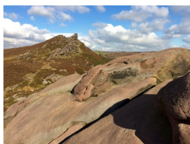
Ramshaw Rocks, Staffordshire (SK 019 622). Delta-top sandstones of the Roaches Grit, Marsden Formation (Marsdenian, Bashkirian, early Pennsylvanian, Carboniferous).