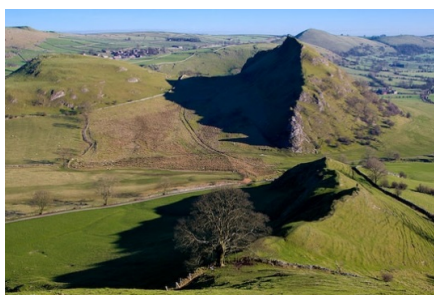
Chrome Hill, Derbyshire (SK 070 673). Apron reef facies in the Bee Low Limestone Formation (Asbian, mid Viséan, mid Mississippian, Carboniferous).

Cost: £25 including transport, packed lunch, field guide and a set of palynomorph slides from the Alportian and Yeadonian sections visited.