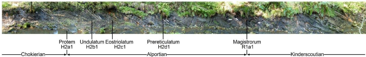
The Alportian Substage stratotype section at Blake Brook, Staffordshire (SK 062 611). This is 12 m of dark, fossiliferous, hemipelagic mudstones of the Morridge Formation. The late Chokierian to early Kinderscoutian succession (Bashkirian, early Pennsylvanian, Carboniferous) is illustrated here.