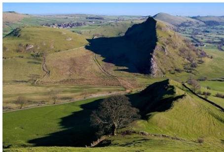
Chrome Hill, Derbyshire (SK 070 673). Apron reef facies in the Bee Low Limestone Formation (Asbian, mid Viséan, mid Mississippian, Carboniferous).

Cost: £25 including transport, packed lunch, field guide and a set of palynomorph slides from the Alportian and Yeadonian sections visited.